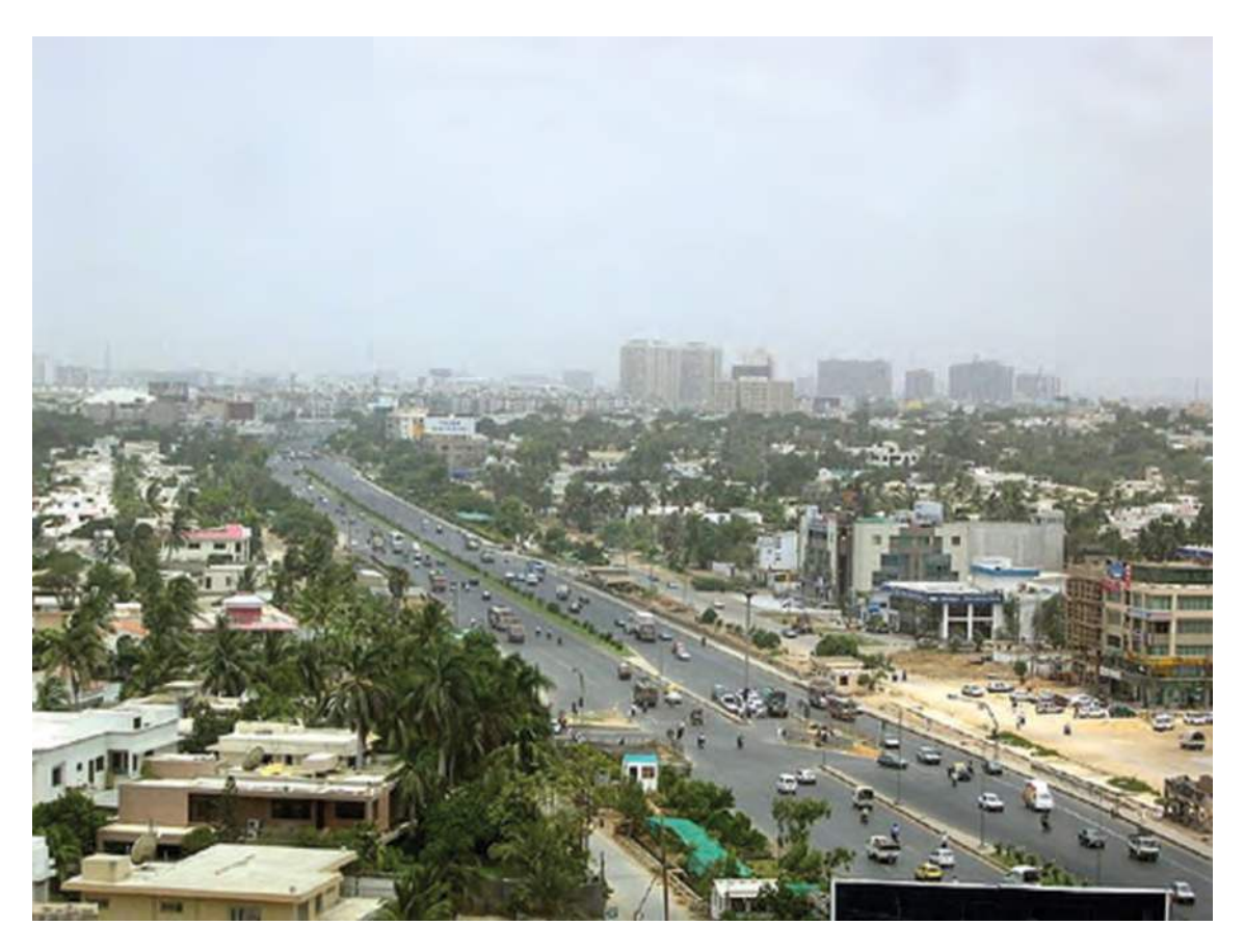
Photograph A for Question 1